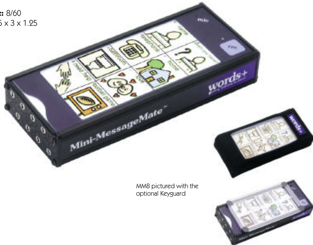
MM8 pictured with the optional Keyguard

Models Available: 8/60 Dimensions: 7.25 x 3 x 1.25 Weight: 1.0 lbs.