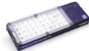
MM40 pictured with both the optional Carrying Case and Keyguard.