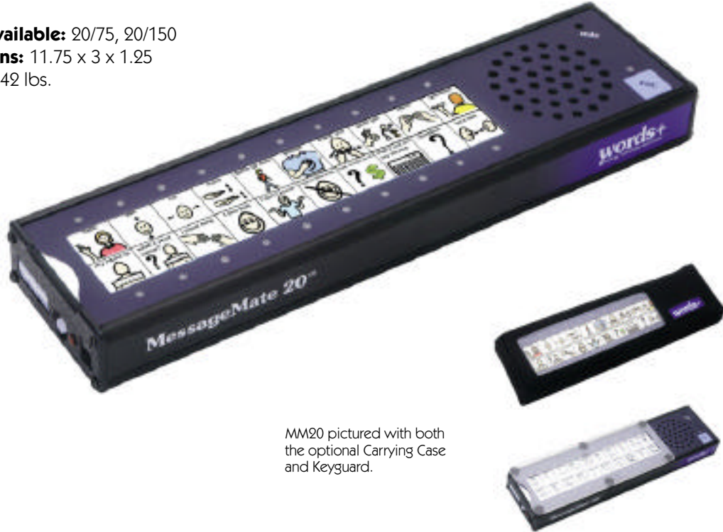
MM20 pictured with both the optional Carrying Case and Keyguard.

Models Available: 20/75, 20/150 Dimensions: 11.75 x 3 x 1.25 Weight: 1.42 lbs.